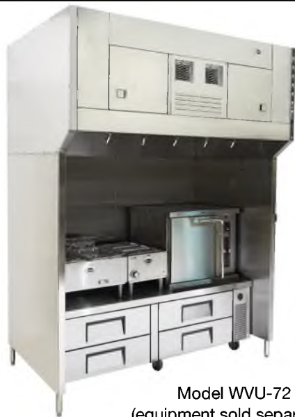
Model WVU-72 (equipment sold separately)