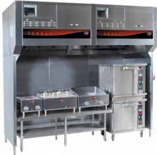
Model WVU-96 (equipment sold separately)